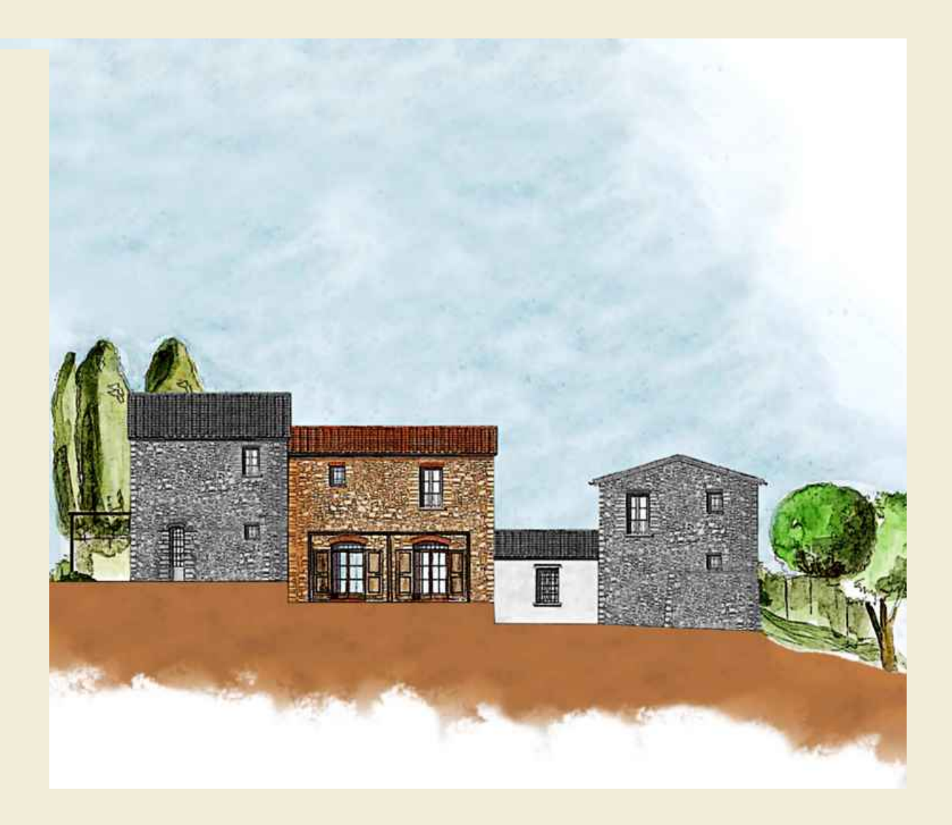
Casa di Mezzo